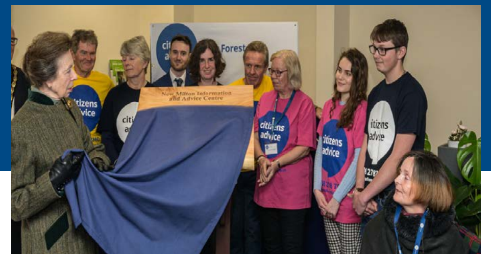
HRH The Princess Royal unveiling the plaque with members of CANF

On 30th March 2022, HRH The Princess Royal proudly opened the new Citizens Advice Office in New Milton, a multichanneled advice hub. HRH The Princess Royal has been patron of Citizens Advice since 1990 and last visited us in the Ringwood office in 1992. Many of our staff and volunteers had the pleasure of meeting HRH The Princess Royal in our fresh New Milton office and watched her unveil the plaque.