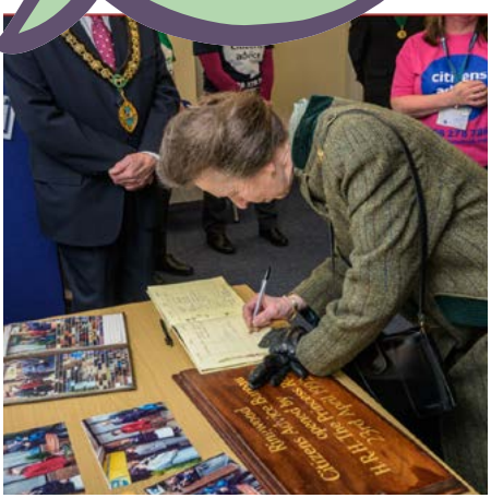
HRH The Princess Royal signing the visitors book, she last signed this in 1992