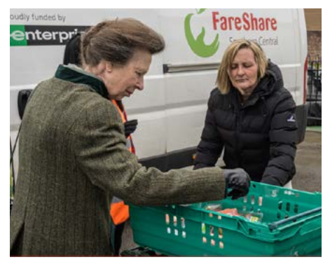
HRH visiting the food larder